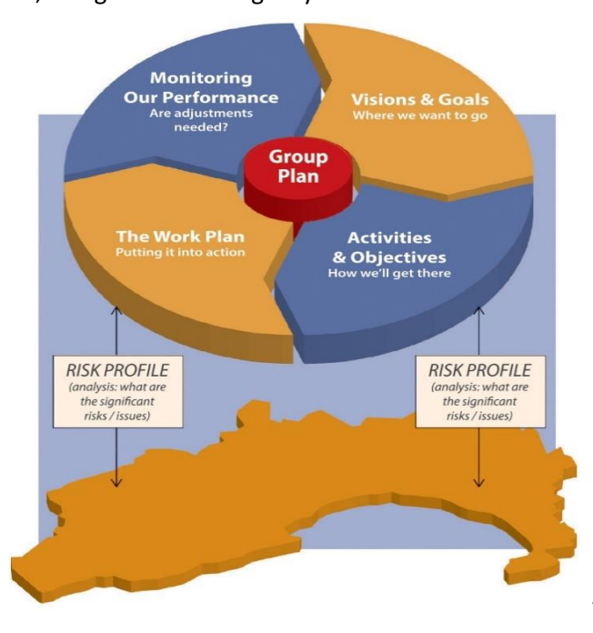
Figure 2: Strategic Planning Process

The process we use to identify, plan, implement and monitor our strategic direction and work is outlined in Figure 2. As the situation changes, we may need to adjust the plan. These changes may be driven by changes to legislation, our risk profile and public expectations, or significant emergency events.